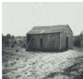
Wooden building used as a school for African American children in Camden, Mississippi, (c. 1921). Library of Congress, Prints and Photographs Division, LC-DIG-ppmsca-0551.

1899-1917: Developing an Early Love for Science 1917-1926: Julian's College Experiences 1926-1929: Julian's Struggle to find a Place as a Chemist 1929-1931: Vienna